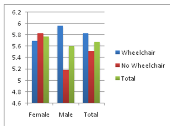
Figure 1 Recommended sentence for the crime of murder.

Experiment 1: results and discussion: A 2 (defendant gender: female, male)x2 (defendant disability: wheelchair visible or not) between-groups factorial ANOVA was calculated. The means and standard deviations are presented in Table 2. The main effect for defendant gender was not significant, F(1,90)=0.308, p=0.580 . The main effect for defendant disability was also not significant, F(1,90)=0.844, p=0.361 . Finally the interaction was not significant, F(1,90)=1.73, p=0.192 (Figure 1).