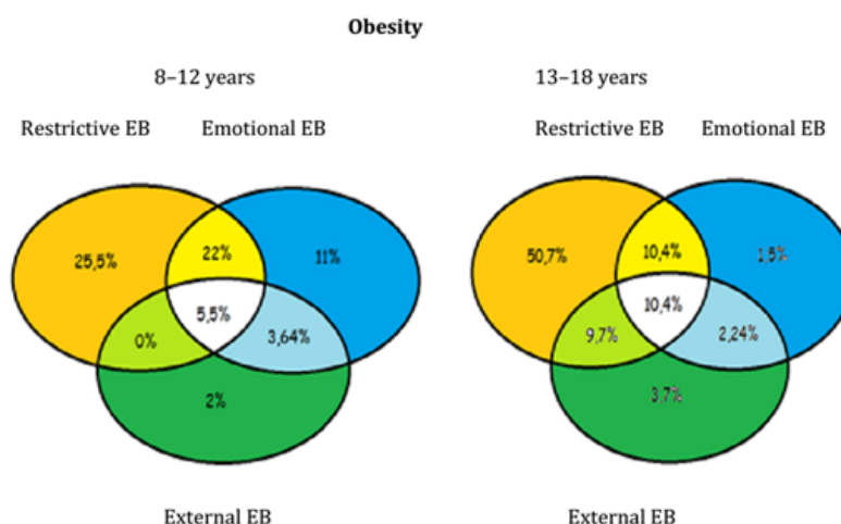
Figure 3 Structure of eating disorders in children and adolescents with a obesity.

In real clinical practice isolated types of eating behavior are rare. In all groups of patients had combination of several types of EB. With age and with increasing body mass was an increase in the frequency of combined types of ED. In the adolescents group revealed an increase in the frequency of occurrence of a combined ED in patients with overweight and obesity compared with adolescents with normal weight.