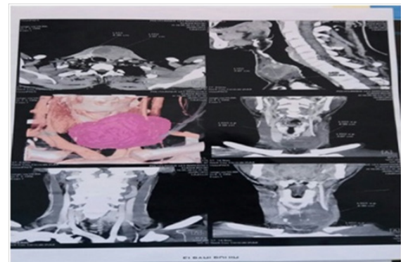
Figure 1 CT scan (before surgery) showing a voluminous cervical tumor process.

be associated with lymphadenopathy were examined, a cervical computed tomography (Figure 2) had shown a large tumorous process from the cervico-mediastinal orifice to the hyoid bone infiltrating the soft tissue without adenopathy, after three days of development the patient died as a result of complications and tumor hemorrhage.