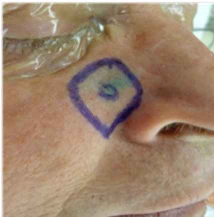
Figure 1 SC of cheek at time of resection after lymphoscintigraphic injection.

Received: October 31, 2014 | Published: June 06, 2015