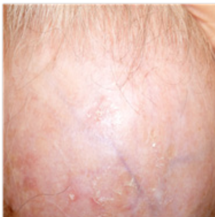
Figure 2 SC on the forehead.