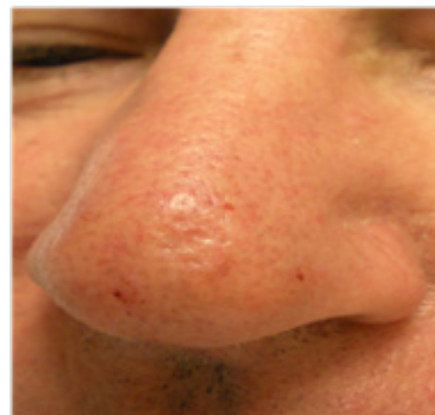
Figure 4 SC on the tip of the nose.