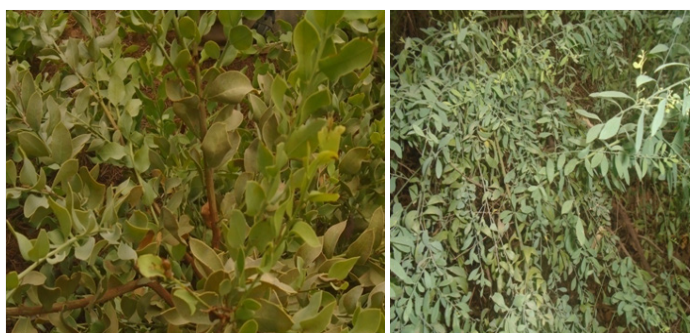
Figure 2 Morphological appearance of Osyris species, A, Osyriscompressa , B, Osyrisquadripartita .