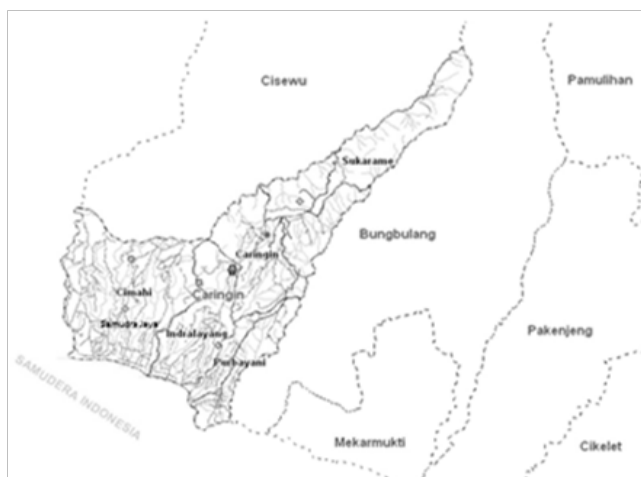
Figure 1 Location of survey at Rancabuaya, Caringin District, Garut (7°31'28" S 107°28'40" E).

The lack of organized markets, nationally or locally could be another reason of negligence. For example, Gadung ( Dioscorea hispida ) and Ganyong ( Canna discolor ) are considered as a source of carbohydrates. Unfortunately, these crops are not popular among the villagers because of its low market value. A consequence of no