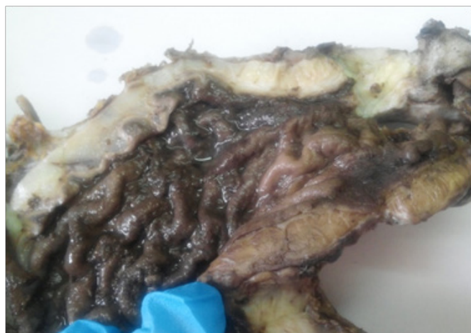
Figure 2 Infiltrative borders are present in the body of lesser curvature.