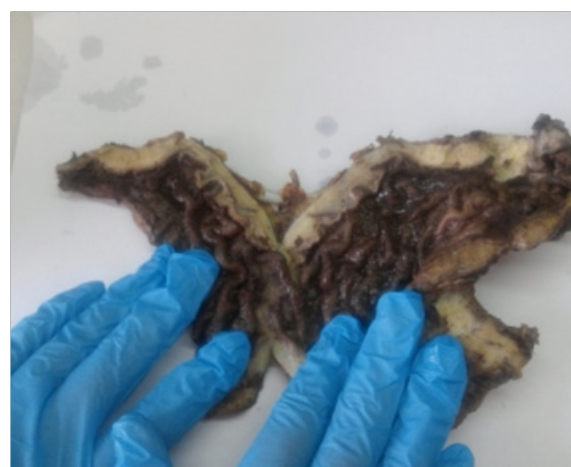
Figure 1 Ulcerated type of adenocarcinoma of stomach with heap up margins.