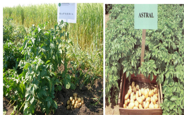
a) Rapsodia Variety b) Astral Variety