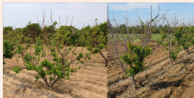
Figure 5: Appearance of 'Lorna' (left) and 'Apache' (right) trees in April 2014 after receiving only 173 chill hours. Both cultivars demonstrate irregular vegetative bud break with large parts of scaffolds devoid of vegetation.

Based on bloom and fruit production data from four crop seasons, five of the six evaluated cultivars could not be recommended for planting in Riverside, CA. Chill accumulation at that location was generally insufficient for those five cultivars. However, higher fruit loads were noted in some cultivars ('Apache,' 'Helena' and 'Patterson') in years where higher chilling was received. Performance of these cultivars might be adequate, at least for non-commercial homeowner production, in locations having a higher average chill accumulation as compared with UCR. These locations would probably be found at higher elevations in Southern California, such as the local mountains; as it is unlikely that any low elevation areas in Southern California would have sufficient chilling for apricot cultivars other than 'Blenheim'. Cultivar Blenheim appears perfectly suitable for non-commercial production in environments with similar chill hours received at UCR. Its extended bloom period might actually be an added bonus for homeowners who would appreciate an extended harvest period, and have fresh ripe apricot available for immediate use.