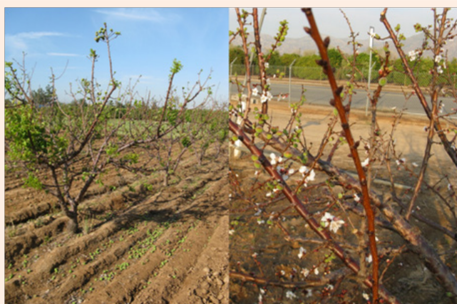
Figure 3: Blenheim apricot trees cultured in Riverside, CA during 2014 produced abundant crops that required thinning, even with as few as 173 chill hours (left). Bloom duration was extended under reduced chill hour conditions, leading to cultivar Blenheim with flower buds, open flowers and developing fruit evident on the same tree (right).

Chill hours received at Parlier ranged from 989 h (2013) to 1225 h (2011) during the study years, well above expected chill requirements for the apricots under cultivation. Five of the six trialed apricot cultivars (exception 'Blenheim') consistently produce adequate yields for commercial production under the environmental conditions present in and around Parlier, CA. High quality 'Blenheim' apricot is still produced on limited acreage in the mild coastal valleys, with 1,400 T (3% of 2016 tonnage) produced statewide in 2016 (B. Ferriera, President, Apricot Producers of California, personal communication). Vegetatively apricot cultivars grew well at the UCR plot, responding to the long growing season that allowed for growth later into the calendar year as compared with growing conditions at Parlier. Adequate summer pruning after the fruit maturity season provided required light for developing flower buds (Figure 4), and all cultivars exhibited well developed flower buds on dormant shoots and spurs while in vegetative dormancy.