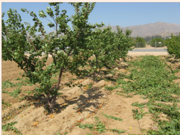
Figure 4: Abundant fruit drop is evident below 'Blenheim' trees cultured in Riverside, CA in 2012. Trees were vigorously pruned after harvest to provide light necessary for proper flower bud development.

blooms throughout the trees. Vegetative bud break was relatively synchronous throughout the trees of each cultivar, and bloom durations were shorter as compared with the same cultivars planted at UCR. Apricots cultured at UCR by contrast began losing floral buds throughout the trees as temperatures began to warm. Pre-bloom flower bud shedding in apricot has been previously documented as a symptom of insufficient winter chill accumulation Tufts [4]. Bloom density was weak in trees of all cultivars except 'Blenheim,' which seemed unaffected by dormant periods with reduced chill accumulation. Irregular vegetative bud break was a common symptom among trialed cultivars grown at UCR (Figure 5). This phenomenon has been previously documented in peaches when winter chill was insufficient for the planted cultivars Weinberger [9]. Vegetative bud break appeared more uniform in 'Blenheim,' indicating a lower chill requirement as compared with the other five trialed cultivars.