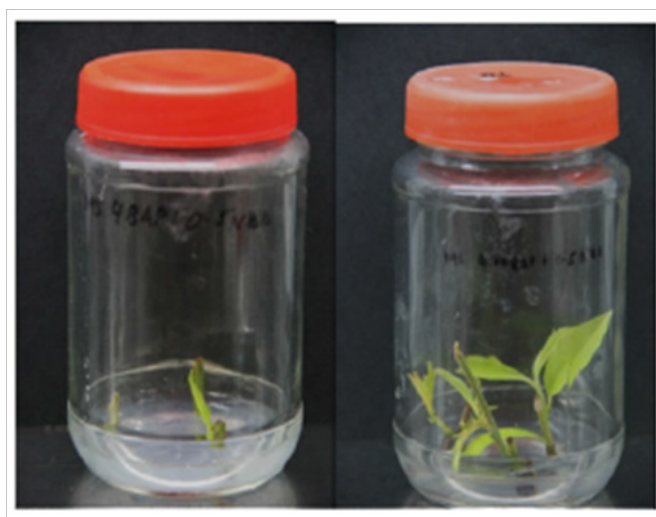
Figure 3 Multiple shoot proliferation of nodal segments of E. zwageri in a culture medium with 5.0 mg/L of BAP in combination with 0.5 mg/L of NAA. Arrow showed the initiation of shoot buds (A) Shoot buds proliferation during third week of culture; (B) Green and healthy leaves development after ten weeks of culture. (Bar=0.5cm).