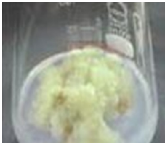
Figure 2 Callus induction.