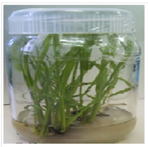
Figure 3 Shoot multiplication.