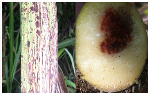
Figure 5 Example of damage from Downy mildew ( Peronosclerospora sacchari ) (left photo) and from white grub borers ( Diatraea saccharalis ) (right photo) in sugarcane harvested from the Control plot. Neither affliction occurred in the sugarcane grown in the Kiko-treated plot.