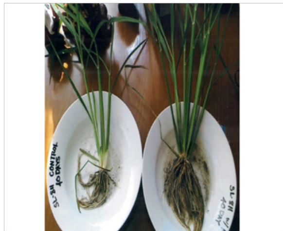
Figure 2 Comparison of rice plants from Kiko-treated versus Control plots in one of the Philippine studies. The two plants were harvested 40 days after germination and show the more abundant and deeper roots of the plant from the Kiko-treated plot (right photo) compared to the Control plot (Left photo). Accelerated earlier root formation was similarly seen in comparisons of plants examined from the Kiko-treated and Control plots at 10, 15 and 20 days after germination. Improved rooting was confirmed in the Australian study and was generally noted by the other participating farmers.

the results from one of the studies showed 29.0gm versus 21.8gm milled rice per 1,000 rice grains. Southeast Asian and Filipino farmers further noted both greater numbers and added weight of each filled cavan sacks. For example in one of the Philippine studies 80 cavan sacks weighed on average 58 Kg from the Kiko treated plot compared to only 48 cavan sacks, with an average weight of 55 Kg harvested from the comparable control plot.