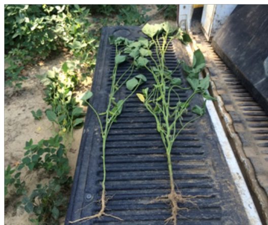
Figure 7 Representative comparison between a soybean plants grown in the Control plot (left) with a similarly aged plant grown in a Kiko-treated plot (right). The plants were harvested 49days after planting. The larger size, more branching, and increased number of soybean pods (39 versus 9), along with a far better developed root structure is apparent in the plant from the Kiko-treated plot.