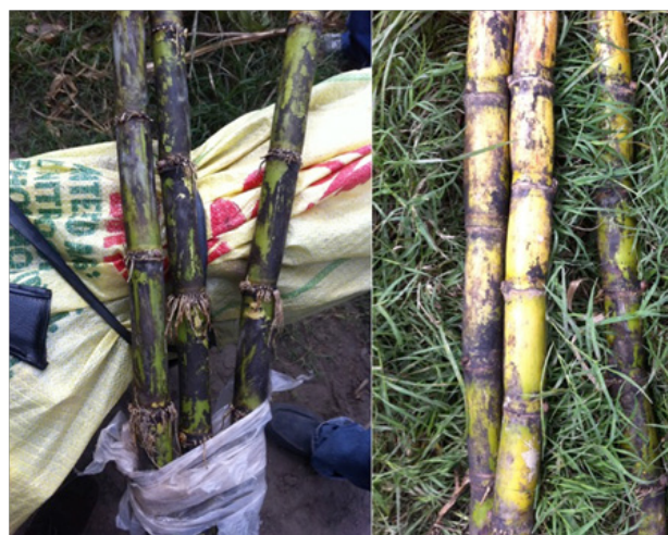
Figure 4 Comparison of sugarcane harvested from the Kiko-treated field (left) with the sugarcane harvested from the Control field. The sugarcane was harvested 1 year after planting. The green versus yellow color and longer intermodal length of the sugarcane from the Kiko-treated field are clearly apparent. On average at the time of harvest, the diameter of the sugarcane stalks from the Kiko-treated plots was 11.3% greater than that of the control stalks.

Several Australian sugarcane farmers have adopted Kiko Technology with confirmation of enhanced growth and increased sugar yields. One farmer reported a yield of 105 tons per hectare from a Kiko-treated plot compared to 70 tons per hectare in an untreated plot, along with an absence of Downy mildew 9 infestation in the Kiko-treated plot.