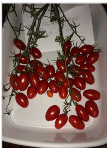
Figure 6 Tomatoes harvested 40days earlier by an Australian farmer from Kiko-treated soil. The standard, post-picking, unrefrigerated time before tomatoes harvested from untreated areas show clearly noticeable spoilage is 20days. This photograph is an illustrative example of the consistent observation that many vegetables harvested from Kiko-treated soil have an extended shelf life. They are also commonly reported as tasting better.

Kiko volcanic rock pellets have been used in the cultivation of numerous vegetables, as well as in aquaculture of fish (unpublished). The vegetables for which direct comparisons have been made between harvests from treated and untreated fields include tomatoes, apples, strawberries, spinach, lettuce, basil, celery, wheat grass, soybean, zucchini, okra, peanuts, chili, capsicums and aquatic plants. In addition to the roughly 30% increased yields, farmers reported improved taste and longer shelf life (beyond 40days in the case of tomatoes) (Figure 6). In each study farmers noted stalks were sturdier, thicker and had more deeply penetrating roots. An example is shown in the comparison of a representative soybean plant from a Kiko-treated and from a nearby untreated field (Figure 7). The use of Kiko Technology has consistently led the farmers to use less fertilizer and harvest earlier than in prior years. For spinach, the harvesting time in one Chinese study was reduced from 38-40days to 30-32days, with a 30% increased yield by weight from 2,497Kg/Mu to 2,997Kg/Mu (Mu is a Chinese equivalent to 667 square meters).