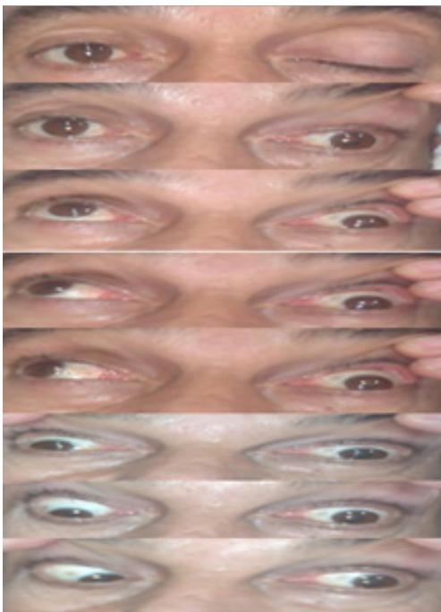
Figure 1 Oculomotor examination showing oculomotor paralysis.

ptosis of the left eye associated with pain along the ophthalmic nerve's territory which was progressing rapidly within 20 days. The ophthalmological examination revealed a best-corrected visual acuity of 7/10 for the right eye and 3/10 for the left. Manual rising of the left upper eyelid unveiled a divergent eyeball associated with a subtotal restriction of eye movement (Figure 1). Further examination with the slit lamp showed a nonreactive mydriasis. The cerebral MRI indicated a malicious tumor of the left posterolateral cavum wall invading the left cavernous sinus and the hypopharynx (Figure 2). A biopsy was conducted and confirmed a poorly differentiated epidermoid carcinoma. The patient's assessment of extent was negative, therefore, benefiting of several radio-chemotherapy sessions. Follow-ups had shown an improvement of visual acuity, decreased ptosis and increased ocular motility (Figure 3).