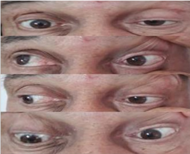
Figure 3 Decrease of ptosis under treatment.