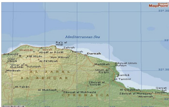
Figure 1 Derna City in northeastern Libya.