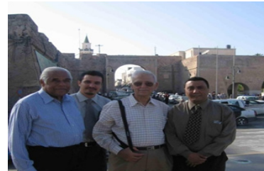
Figure 2 Workshop for planning 5 years prevention of blindness in Libya.

problems and there for to get the required reliable information for the intervention of comprehensive eye care program . This survey also will remain as scientific paper which can help for more prevalence studies, and can provide baseline data for further analytical study in this field that can provide some statistical information support (Figure 2).