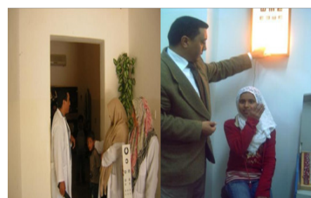
Figure 3 Acknowledgement.

We are thankful to Director Board of Secondary Education, rector of Almutkar Medical University and all the school teachers and health workers who supported me in every stage of the study (Figure 3).