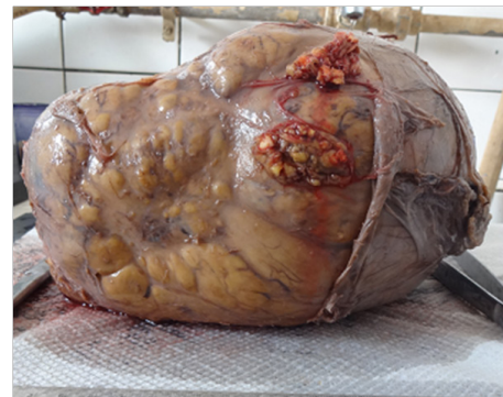
Figure 2 Hetero-nodular adrenocortical carcinoma partially covered with a greyish capsule.

Those cancer were less frequent and an adrenocortical carcinoma, a neuroblastoma and a pheochromocytoma were the 3 cases found. The case of adrenocortical carcinoma is shown in Figure 2 with microscopic features in Figure 3.