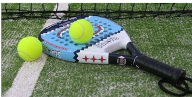
Figure 4 Ball and paddle shovel.