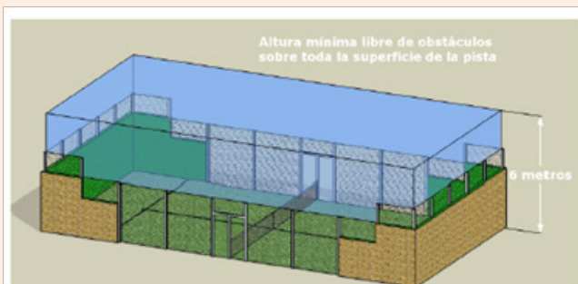
Figure 3: Enclosure Pádel track.

sports performance. As the most relevant results, the male paddle player has a mesoendomorph and female endomesomorph profile [8]. It is an intermittent acyclic sport, the most important metabolic pathway is aerobic [9] and 82% and 93% of the maximum HR [8]. Finally, Bartolomé et al. [10] have analyzed the amount of concentration of minerals in the urine to determine the internal load of this sport. As a most relevant result, these authors have found low levels of Lithium (Li) in the concentration of urine after a match of paddle, this being an essential mineral since it is related to the energy metabolism and the regulation of the adequate function of several biological systems Bartolomé et al. [10].