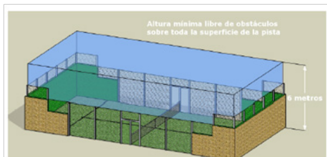
Figure 3 Enclosure Pádel track.

result, these authors have found low levels of Lithium (Li) in the concentration of urine after a match of paddle, this being an essential mineral since it is related to the energy metabolism and the regulation of the adequate function of several biological systems Bartolomé et al. 10