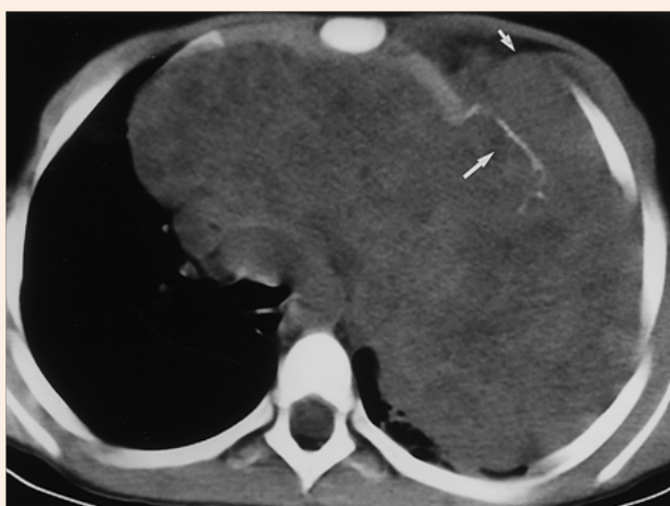
Figure 2: Un-enhanced CT shows expansile destructive mass of left anterior rib with postero medial displacement of destructive fragment. The large soft tissue density mass is occupying the left thoracic cavity and extending in to right hemi thorax.