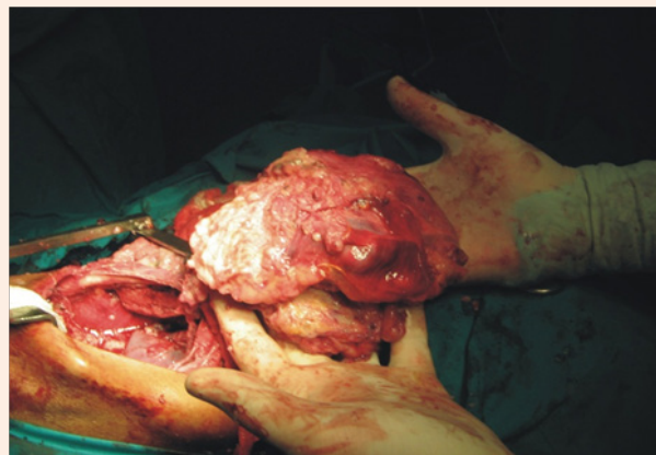
Figure 3: Partially encapsulated mass taken off completely from Left hemi-thorax.

that had to be operated urgently before the chemotherapy survived and received chemo-radiation later on thus signifying the importance of timely and proper surgery. Referral to proper hospital is mandatory who cater these kind of cases.