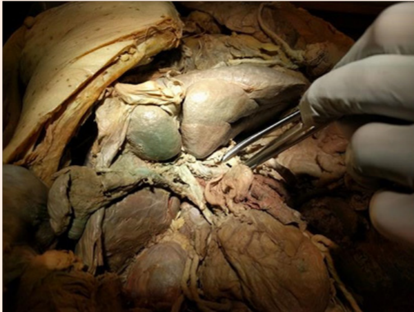
Figure 3: Overview of the cadaver with obvious anomaly noted in the anterior surface of the liver with an additional lobe.

dorsal mesentery of the gut, later referred to as coeliac, superior mesenteric and inferior mesenteric arteries [5,6]. However, the anomaly we have demonstrated in this case occurs as a result of malfusion of the vitelline arteries during the developmental stage [6].