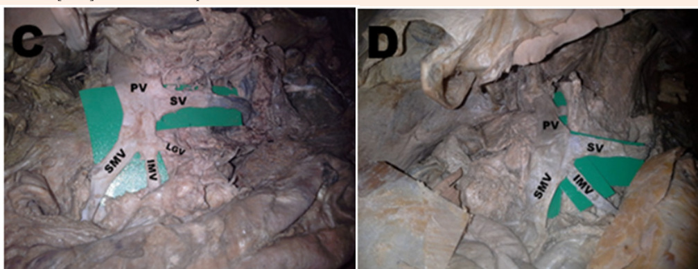
Figure 1C: Type IB pattern of formation of the portal vein [PV] by the union of the superior mesenteric vein [SMV] and the splenic vein [SV]. The inferior mesenteric vein [SMV] drains to the superior mesenteric vein. Note the left gastroepiploic vein [LGV] joining the superior mesenteric vein together with the inferior mesenteric vein.