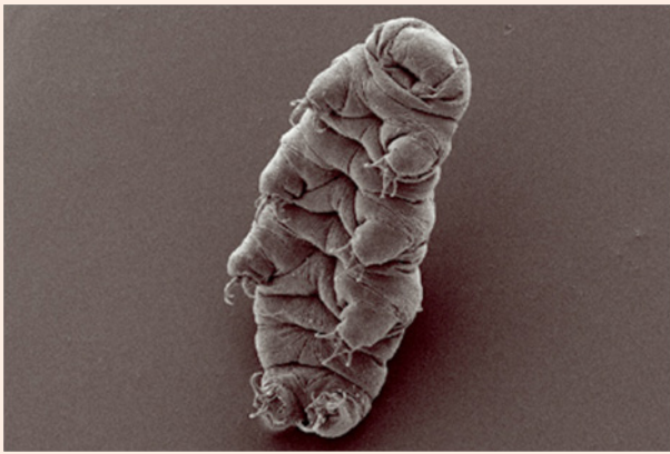
Figure 1: Image of a tardigrade under scanning electron microscope.

that during the process of desiccation, tardigrades or water bears go through a process of muscle reorganization to change their structure. The changes in shape were observed with confocal laser scanning electron microscopy shown in Figure 1 and 3D constructs [8]. This experiment supports the claims of tun formation and entire body contraction by Jonathan C Wright.