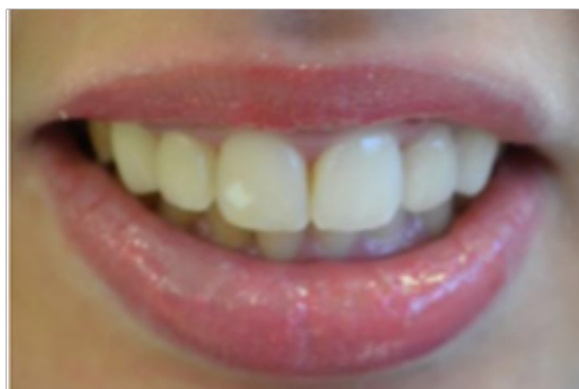
Figure 7b Smile