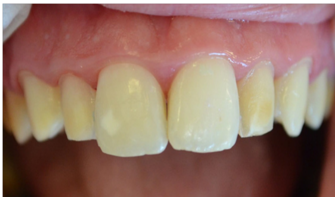
Figure 3 Tooth preparations.

Use of preparation template or silicone putty index. The use of depth cutters or grooves and dimples allows accurate judgment of depth. Proximal preparation was not carried out and the contacts were not involved. In certain situations, breaking the contact may be necessary to change for example the shape or position of teeth; this allows the ceramist freedom to adjust the contours and position of the teeth. About the cervical margin, a chamfer design with a depth of 0.5mm, the depth of preparation is usually influenced by dyschromia. This depth allows the veneer to reproduce natural tooth contours and not to be over contoured, furthermore, a simple seating and minimizes stress enhancing the future resistance of the ceramic. In order to reproduce the natural tooth color, the margins were sub-gingival and oral hygiene instructions should be extremely respected (Figure 3). 12 After adequate gingival retraction, (Figure 4) a two step dual impression was made and sent to the laboratory for fabrication of lithium disilicate (IPS e max) veneers.