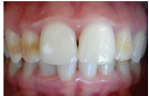
Figure 2 Intra oral views