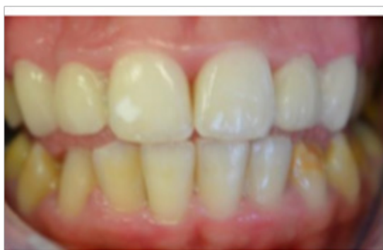
Figure 7a Final situation

Teeth were etched with phosphoric acid and adhesive was applied. Bonding of veneers was carried out following the predetermined luting sequence. It's very important to control the exact seating and that veneers don't occupy any space meant for the adjacent veneer. The luting cement was intra-orally light cured for 1 to 2 seconds and excess was carefully removed, flowed by thorough curing of the luting agent. If the bonding procedure was completed smoothly with a well fitting veneer. It's preferred it not use a rotary instrument to finish the margins (Figure 7). Periodic follow-up was scheduled to evaluate the gingival health and patient comfort and satisfaction