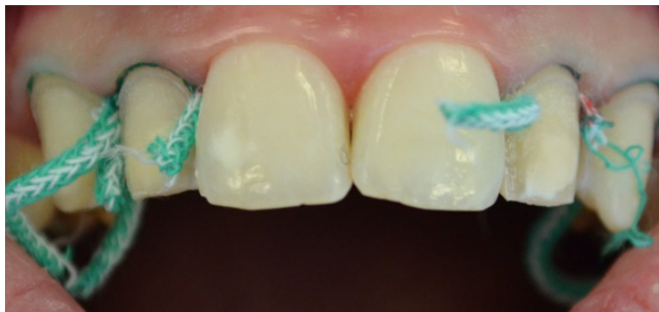
Figure 4 Gingival retraction.