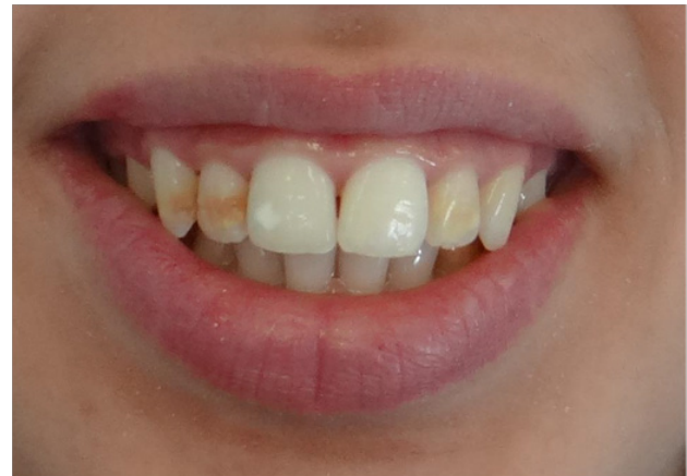
Figure 1 Facial view of initial situation.

In our case, It's score 4 so moderate fluorosis: Brown stain is frequently a disfiguring feature (Figure 1) (Figure 2). The preparatory stage of the treatment started with aesthetic analysis photographs, study models and preliminary shade selection. The various treatment modalities for dental fluorosis, were classified according to the 'therapeutic gradient' of Gill Tirtlet and Jean Pierre Attal, 9 including polishing, microabrasion, dental bleaching, composite veneers, porcelain and full veneer crowns. Hence, external whitening was offered to our patient during two weeks without any improvement. So It was decided to place ceramic veneers on the lateral incisors and canines, on the right central incisor a conservative treatment by 'micro-abrasion' was decided as a relatively low risk intervention.