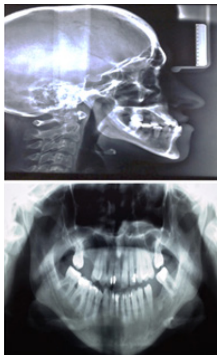
Figure 2 Pre-treatment lateral cephalogram and panoramic radiographs.

remaining maxillary teeth and at the third appointment brackets were placed on the mandibular teeth. Interproximal reduction of mandibular teeth in proximal contact was performed and some of the mandibular edentulous spaces were reduced with elastic powers chains.