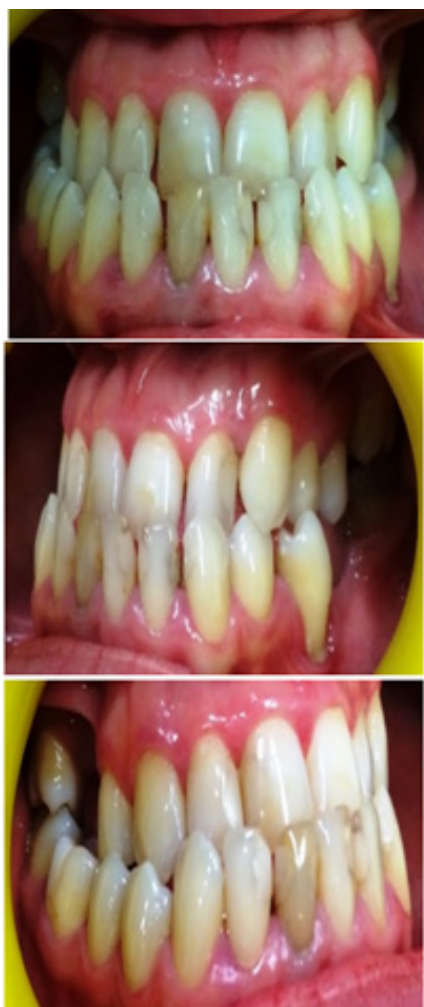
Figure 1B Pre-treatment intra-oral photographs.