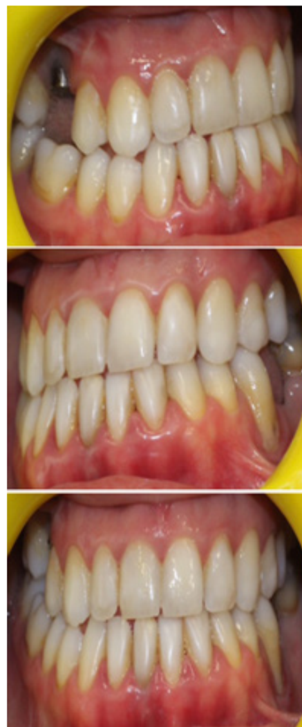
Figure 5B One year post-treatment intra-oral photographs.