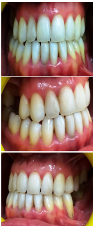
Figure 3B Post-treatment intra-oral photographs.