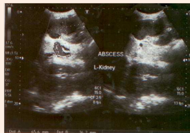
Figure 1B: Normal right kidney.