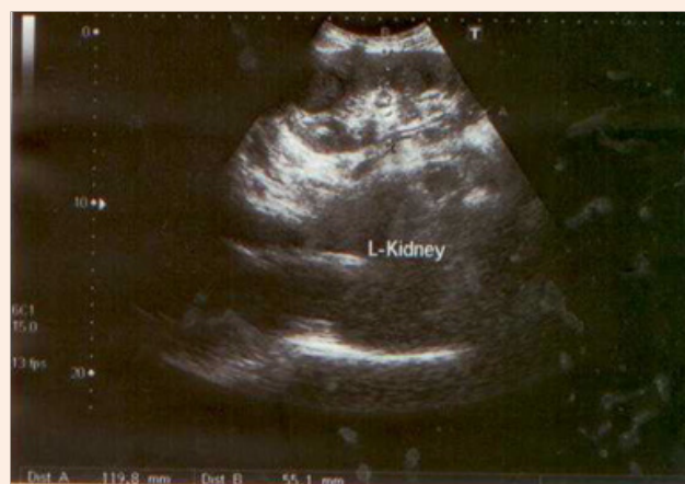
Figure 1C: Perinephric abscess in left kidney.