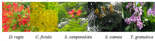
Figure 1 Tropical flora.

Jamaica has a diverse distribution of tropical flora. These plants possess a wide array of secondary metabolites which in some cases display medicinal properties which are unknown to the local populace. There is an ever increasing demand to evaluate the antioxidant properties of plant extracts with the aim of finding natural antioxidants which can replace the need for synthetic antioxidants. Five local trees namely Cassia fistula , Senna siamea , Delonix regia , Spathodea campanulata and Tibouchina granulosa (Figure 1) were selected for investigation. Extracts from the flowers of these plants were investigated as most of the scientific literature focuses on the biological activity of the leaves and stems of these plants.