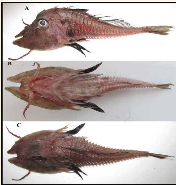
Figure 2: Side (A), Ventral (B) and Dorsal (C) view of Satyrichthys milleri from Gulf of Mannar.

border of orbit, lower jaw reaching below anterior border of orbit and jaws; vomer and palatine toothless; Flat and triangular rostral projections on both sides being parallel, length as long as its width at base. No rostral, small and stout post temporal spine with ridge. Longitudinal ridge are running from preopercle to rostral projection; Two opercular spines one uppermost smaller and lowermost larger with a ridge. Gill rakers on the first arch resemble a stick with minute spines on inner side (Figure 2A). The morphometric characters and meristic counts of the collected specimens were taken and compared with existing specimens were shown in Table 1.