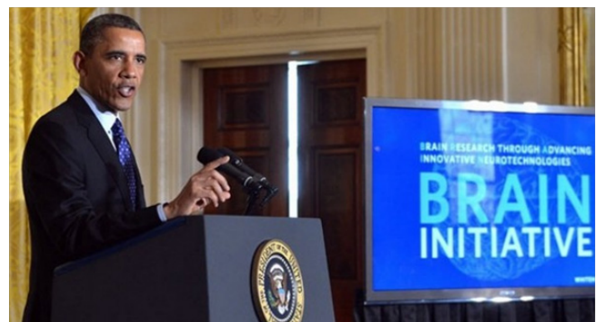
Figure 1 The President of the United States of America Barack Obama announcing the BRAIN project, Source. 6

Recently the president of the United States of North America, Barack Obama, has presented the BRAIN project. In addition to USA, the European Community and China also develop very similar brain research projects. In China, it is also called BRAIN project and in Europe, HUMAN BRAIN project. The project is developed together with multinational corporations linked to the economic powers (Figure 1).