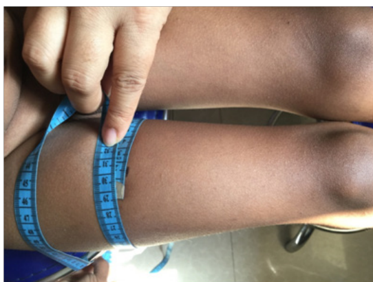
Figure 3A Rt. lower limb is 2.5cm longer than left and Rt. thigh is 1.5cm larger in circumference at mid thigh than left.