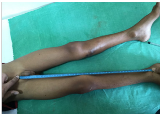
Figure 3 asymmetric body proportion with hemihypertrophy.