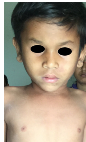
Figure 2 On examination of other system he has a triangular face.