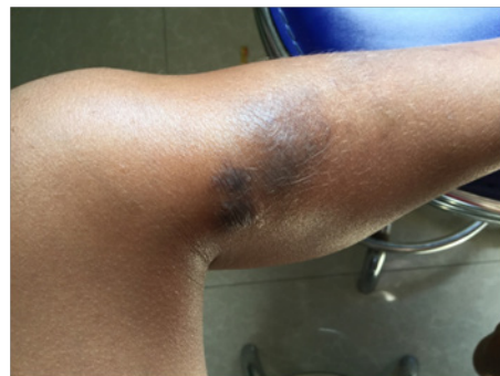
Figure 1 Slight blue coloured skin staining but over a span of seven years superficial skin changes to light brown.

Doppler study of soft tissue swelling showed arterio-venous malformations (Figure 4) mostly venous flow channels suggestive of venous hemangioma with feeding vessels coming from anterior tibial artery and draining vein is great saphenous vein. There is no change in the bone size of both tibia but localized soft tissue swelling is proportionate to hemangioma. To evaluate presence of arterio-venous malformation in other body sites we did USG whole abdomen, CT angio brain but all are normal.