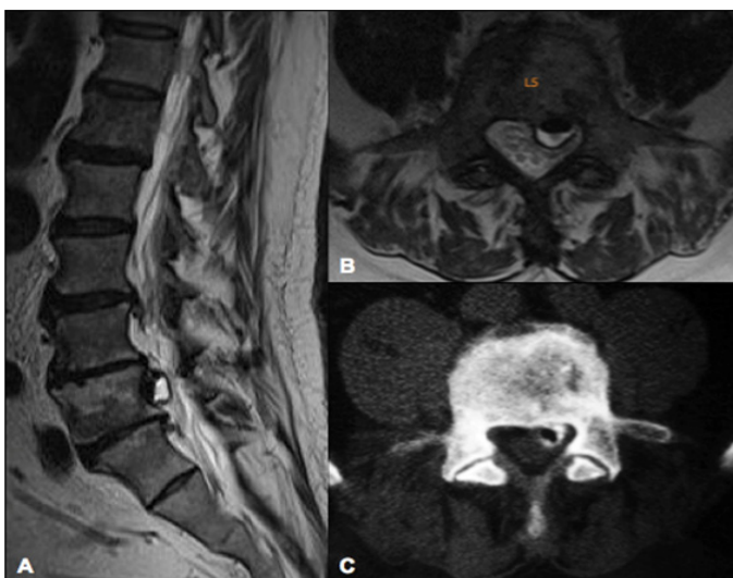
Figure 2 Patient 2, 61-year-old male patient. A and B ) Sagittal and axial views of RMI T1 sequence that demonstrate a hypointense image with regular edges behind L5 vertebral body with a liquid level inside; C ) Axial view of CT-sacan after discography showing a hypodense area with contrast surrounding it, that confirms disc communication with the air content of the pseudocyst.

Anterior-posterior (AP) and lateral lumbosacral X-Rays were performed as well as lumbosacral MRI (Figure 2A & 2B). At T1 and T2 MRI sequences, a hypointense cystic image was found at L5-S1 disc level. Posteromedial left sided extension displaced the corresponding root. To certify the disc origin of this gaseous collection, we perform discography (Figure 2C). The manometry of the fifth lumbar disc reflected an intense low back and left sciatic pain similar to that previously reported by the patient. The control images demonstrated a cystic lesion connected to the fifth lumbar disc, with contrast inside, confirming the diagnosis of gas-containing pseudocyst.