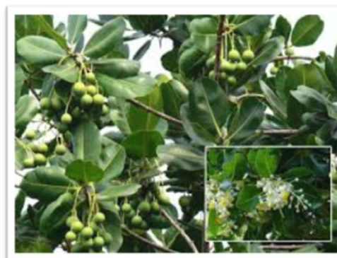
Figure 2 Plant profile of Calophyllum inophyllum .