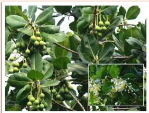
Figure 2: Plant profile of Calophyllum inophyllum .

kidney and causes congestion of the kidney. It converts the uric acid in to carboxylic acid and excretes from the kidney. It delays the decomposition of urine. It also acts on joints and gives rheumatic complaints and joints become filled with uric acid phosphate.