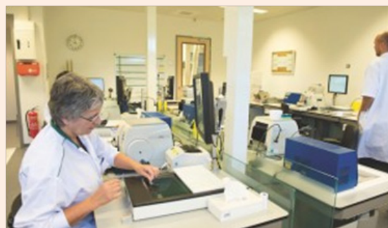
Figure 5: In traditional pathology laboratories, many steps in the specimen preparation process are performed manually.

consultation, by being sent directly to the external consultant, or by giving the professional access to view the images from a secluded location. Efficiencies in lab operations are another promising mark of digital pathology. Histopathologists have traditionally performed diagnostic readings by viewing glass slides while standing (or sitting) over a microscope. A noticeable but important element of histopathology laboratory digitization is that it basically changes the pathologist's primary workstation, moving the histopathologist from the microscope to a computer workstation. This change can help to ease the physical fatigue and tension placed on pathologists from leaning over a microscope for many hours a day (Figure 6).