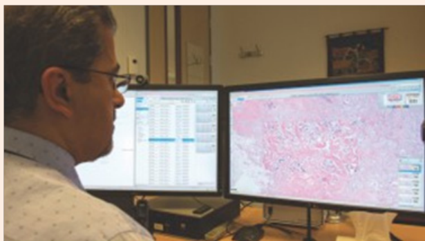
Figure 2: The case viewer of the IntelliSite pathologist suite.

The transition from microscope-based image analysis to digital pathology may seem like a natural progression, in line with the rising tide of widely varied digital technologies that are