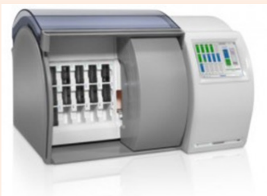
Figure 4: The IntelliSite ultra fast scanner by Philips Digital Pathology Solutions, Best, the Netherlands.

In traditional pathology workflows, many steps in the specimen preparation process are performed manually, making it difficult to keep track of specimens and where they stand in the process. Using a digital histopathology solution permits histopathologists to identify and keep track of where specific specimens stand in the review process, and facilitates the department to determine whether schedules or protocols are adhered to, or why delays may be occurring (Figure 5). Among the benefits of a digital histopathology solution is the fact that digital slide images can be more appropriately and safely distributed for exterior