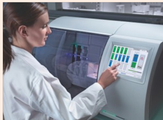
Figure 1: A lab technician initiates scanning with the IntelliSite ultra fast scanner.

support faster, more-accurate disease diagnosis-and subsequent treatment and care-particularly for cancer (Figure 1).