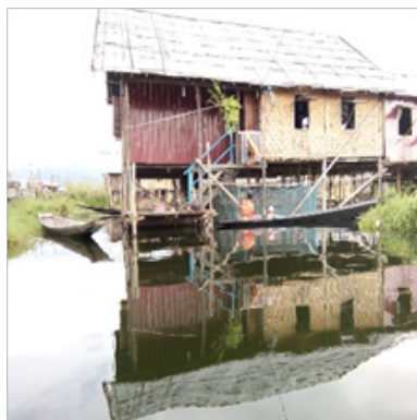
Figure 3 Floating cage under house in Pauk Par Village.