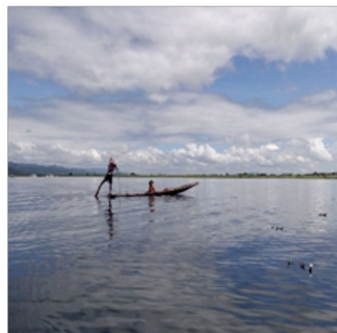
Figure 2 Inle Lake.