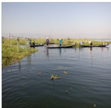
Figure 6 Fishermen set up the gill nets.