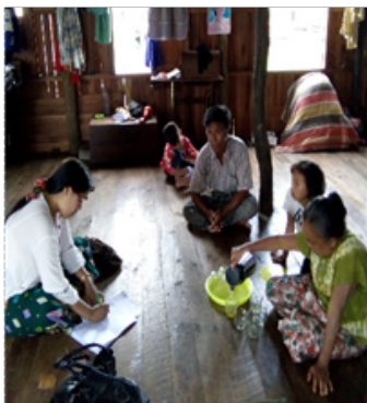
Figure 4 Interview the fisherman in Kyar Taw Village.