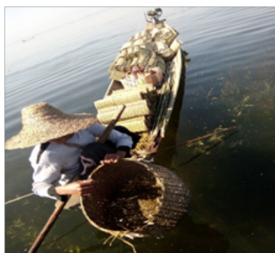
Figure 5 Fisherman set up the traps.