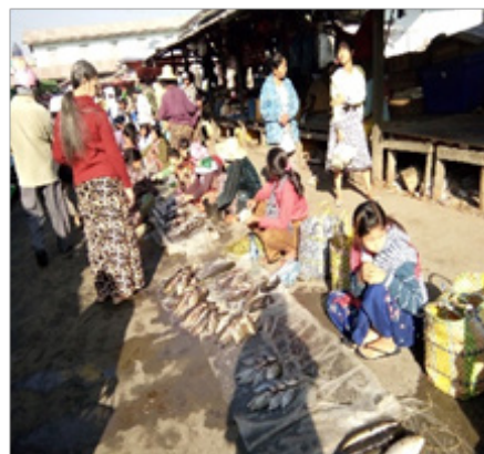
Figure 7 Fish sellers in Nyaung Shwe market.