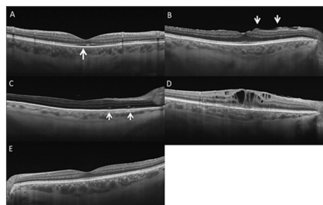
Figure 2 Swept Source Optical Coherence Tomography (DRI I-Atlantis, Topcon Corp, Japan) showing the different patterns that we have identified. A Disruption of ellipsoid zone (white arrow showing disruption of IS-OIS in subfoveal area). B Inner retinal folds arrowed. C Outer Retinal folds arrowed. D Macular oedema. E Normal OCT.

Macula OFF RRD was associated with macular abnormalities on SS-OCT in 84.6% (11/13) of eyes and Macula ON RRD in 27.3% (3/11). Perhaps as expected, a normal SS-OCT appearance was highly associated with eyes with macula ON RRD 72.7% (8/11) compared with macula OFF RRD 15.4% (2/13). SS-OCT showed changes in the neuroretina in 58.3% (14/24) of all eyes. We classified these changes into: 1. Changes in ellipsoid zone (EZ) (Figure 2A) (50% of eyes (7/14)), 2. Inner Retinal Folds (IRF) (Figure 2B) (14.3% of eyes (2/14)), 3. Outer Retinal Folds (ORF) (Figure 2C) (21.4% of eyes (3/14)), 4. Macular Oedema (7.1% of eyes (1/14)) (Figure 2D)) and 5. ERM (7.1% of eyes (1/14)). Nine eyes (37.5%) did not present any alteration on SS-OCT and these were coincident with asymptomatic patients (Figure 2E). The presence of changes in ellipsoid zone, Inner or Outer Retinal Folds on SS-OCT scans was associated to the suffering of post-operative visual symptoms such as metamorphopsia or blurred vision see Table 1.