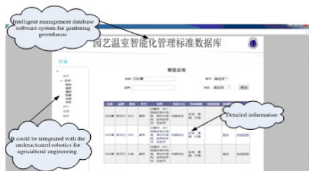
Figure 1 Intelligent management database software system for gardening greenhouse (Part A).

In the development of the underactuated robotics for agricultural engineering, it is important to develop the intelligent management database software system for gardening greenhouse, including Part A and Part B, as shown in Figure 1 and Figure 2. Using the principles of knowledge engineering and information technology, combining the greenhouse horticultural crop model with the database system platform, an intelligent management standard database software system was established, including a knowledge base, a model base, a database, an inference engine, and a human-machine interface. The system comprehensively uses such mechanisms as reasoning, prediction, and explanation to help users design cultivation management plans, answer questions about cultivation techniques, and dynamically simulate and predict the growth process of greenhouse horticultural crops. The intelligent database management software system for greenhouse horticulture crops combines the forecasting function of the model with the logical reasoning of the expert system to improve the cultivation and management of greenhouse horticultural crops.